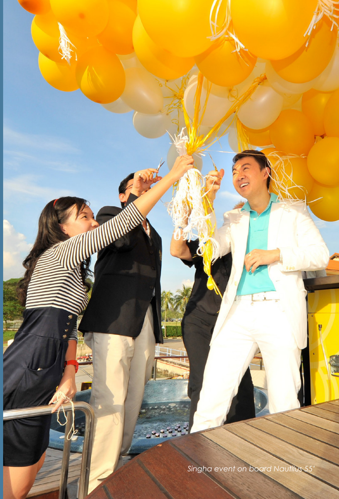
Singha event on board Nautilus 55'