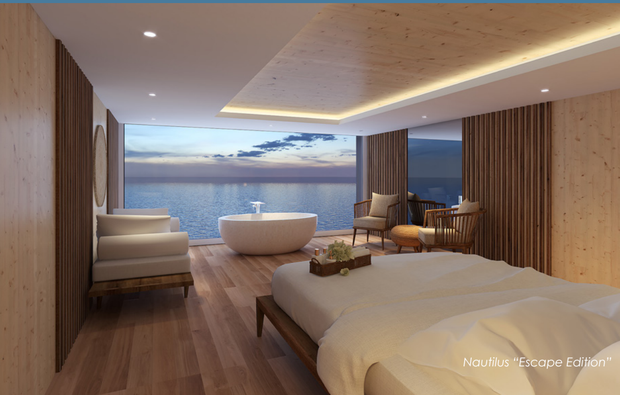
Nautilus "Escape Edition"

Adopting our proven mass timber CLT technology, we have created a light yet robust, beautiful wooden environment, conducive to perfect sleep. The soak tub is framed by your personal portal to the World.