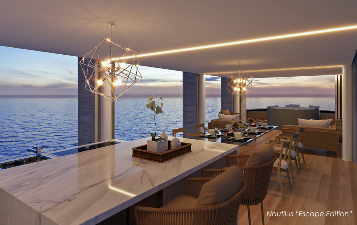
Nautilus "Escape Edition"